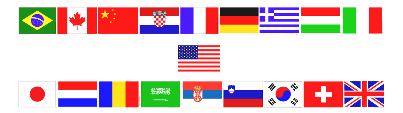
Flags of the countries of SCAD '09 attendees

The welcoming reception was held on Thursday, July 16 at the meeting hotel. The social program throughout the meeting was a good opportunity to see old friends, to meet new ones, to exchange ideas and experiences and to discuss possible collaborations.